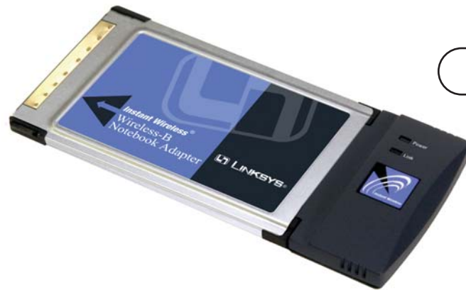
WPC11 ver. 4