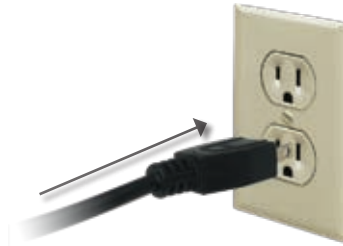
Plug Power into Outlet