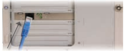
Connect Other End of Network Cable