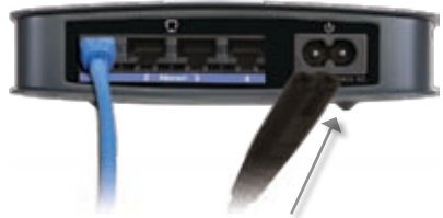
Connect Power Cord