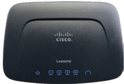
Power, Ethernet, and Powerline LEDs Light Up