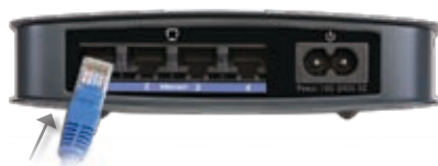
Connect Ethernet Network Cable