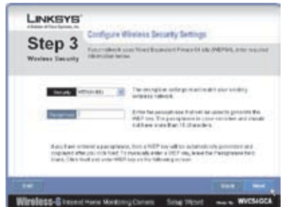
WEP (64-Bit or 128-Bit)

WEP (64-Bit) or WEP (128-Bit) To generate the WEP key automatically, enter a passphrase in the Passphrase field and click Next . The passphrase is case-sensitive and should not be longer than 16 characters. It must match the passphrase of your other wireless network devices and is compatible with Linksys wireless products only. (If you have any non-Linksys wireless products, enter the WEP key manually on those products.)