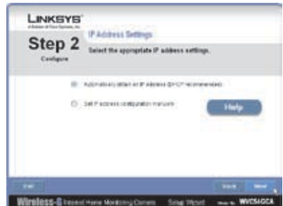
Automatically Assign IP Address Using DHCP

Automatically obtain an IP Address Select this option if you want to automatically assign an IP address to the Camera using DHCP. If you are not sure which option to choose, Linksys recommends this option.